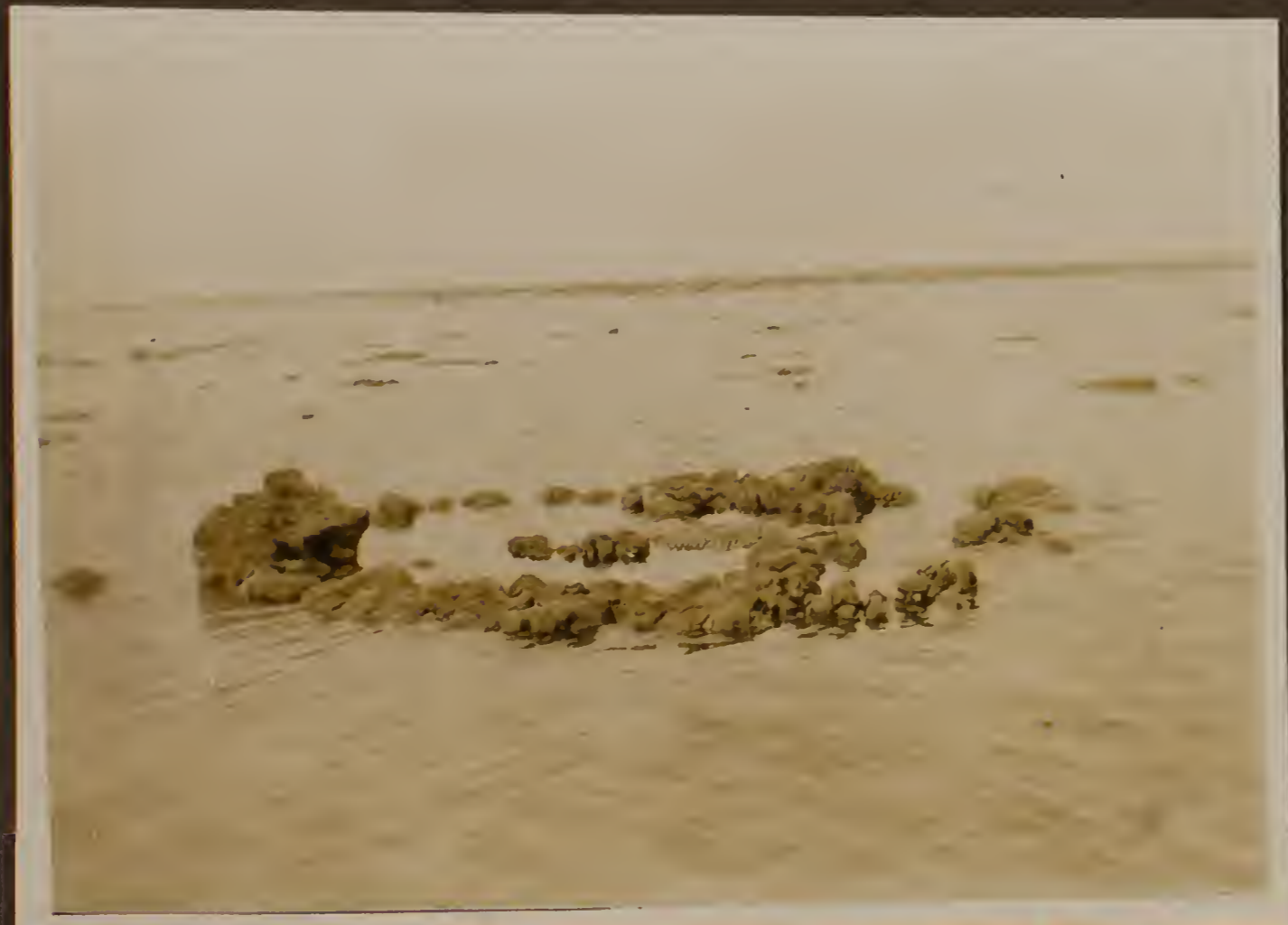
Batt Reef 2nd 38